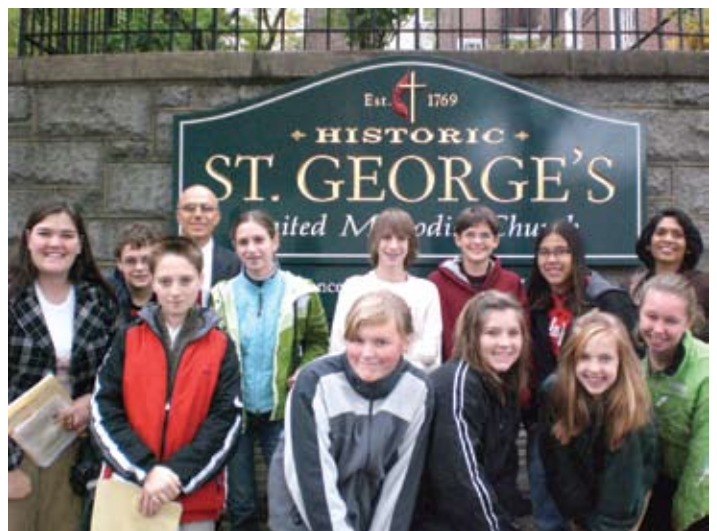
Confirmands from Princeton UMC joined us at worship in December.